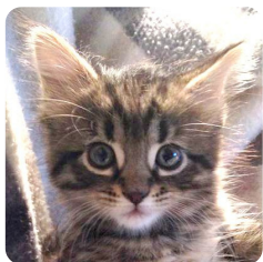
6-8 weeks Active and playful, 1-2 pounds