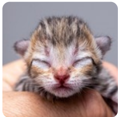
0-2 weeks Eyes closed or barely open