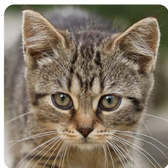
8+ weeks Very active, 2+ pounds

Our staff may ask the age of the kittens. This guide can help you determine their age range.