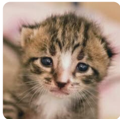
2-4 weeks Eyes open, becoming mobile