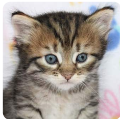
4-6 weeks Mobile and talkative, can eat food